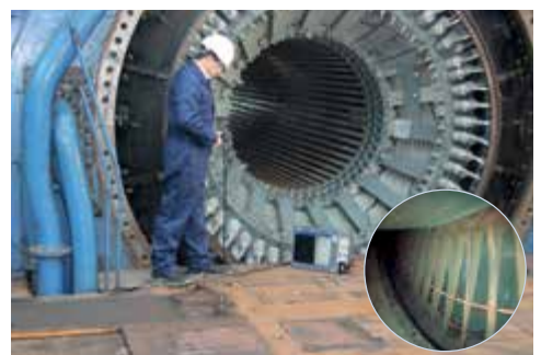
Inspecting a generator stator housing with a videoscope and the TECHNO PACK® T LED documentation unit