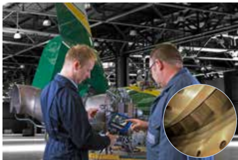
Inspecting a helicopter turbine with the MoVeo videoscope

The KARL STORZ Industrial Group has developed into a very successful full-range supplier in non-destructive visual inspection. This provides KARL STORZ with a wealth of experience across all applications. Whatever your requirement, we have the solution.