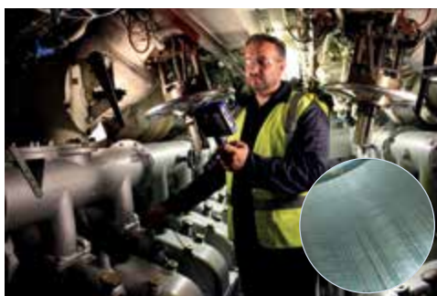
Inspecting a submarine diesel engine with the MoVeo videoscope