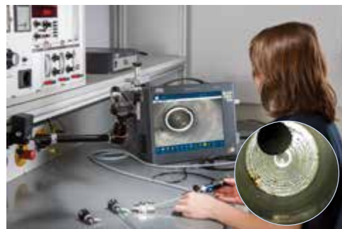
Inspecting tool components with a borescope and the TECHNO PACK® T LED documentation unit