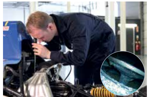
Inspecting engine components with a borescope