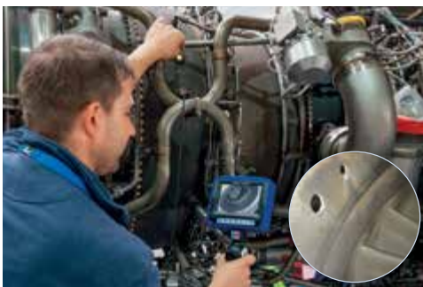
Inspecting an aircraft turbine with the MoVeo videoscope